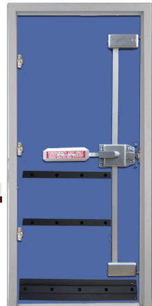
Door Strengthening Bars

Lower Module Reinforcement Kit Extra anti-pry & door stiffener plate, with thru-bolt bracket over module