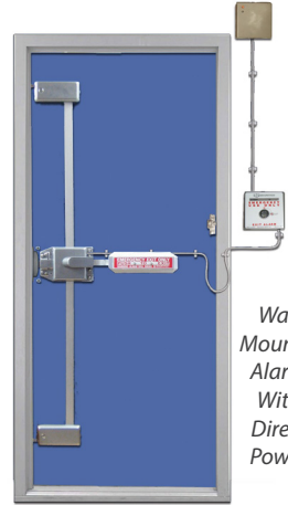
Wall Mounted Alarm With Direct Power

Choices include: 9volt battery only, 110v direct power, signal only (alarm by others), digital counter or no alarm.