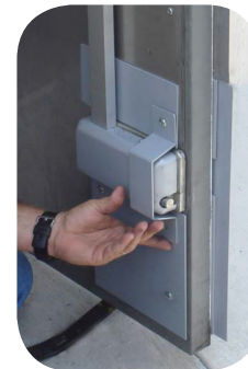
Lower Module Reinforcement Kit

Electric Release Option Available On All Models For card access, keypad, or remote release